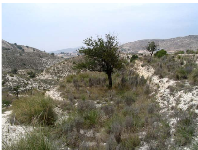
Plate 1 – Oldfields with single carob trees ( C. siliqua ) abandoned 25 years ago in the study area (Alacant, SE Spain).

The selected oldfields were sampled during the springs of 1999 and 2000. The area of each oldfield and the projected canopy area of each associated C. siliqua tree was measured. All the woody species present underneath the canopy of the C. siliqua trees (hereafter named Tree microsite) and outside this canopy (hereafter named Field microsite) were counted. Species were divided in two types: fleshy-fruited (with fleshy mesocarp) and non-fleshy-fruited. From these data, we ob-